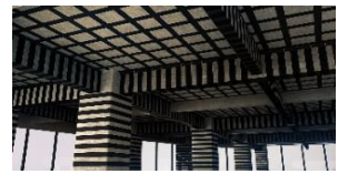
Curing and protecting

1. Surface Preparing: Remove the coating of concrete surface with grinder. Polishing the Surface. If there is angular, grinder it into round.