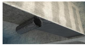
Pasting carton fiber cloth