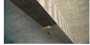
Applying epoxy resin adhesive