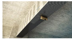
Applying adhesive again